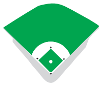
Typical Baseball Field Compared To Larger Cricket Field in size.

Cricket and Baseball are the best-known members of a family of bat-and-ball related games. Earliest mentions of Cricket appear some 200 to 300 years before Baseball. While many of their rules, terminology, and strategies are similar, there are many differences—some subtle, some major—between the two games.